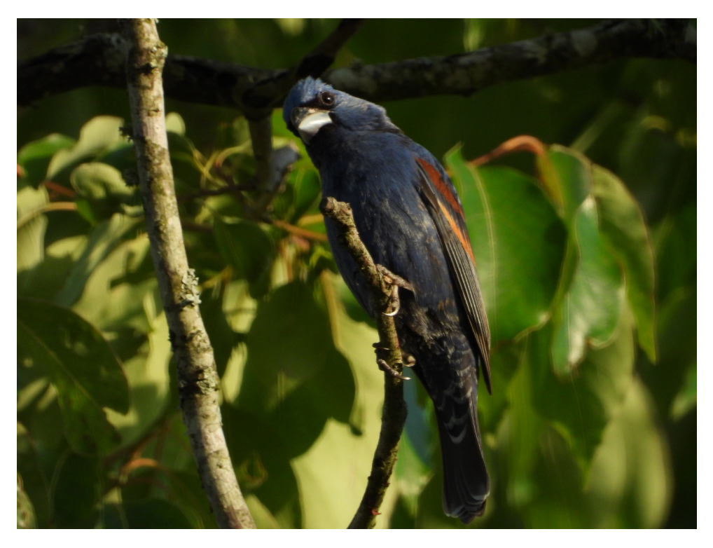
Blue Grosbeak

I want to thank everyone who helped with this count!