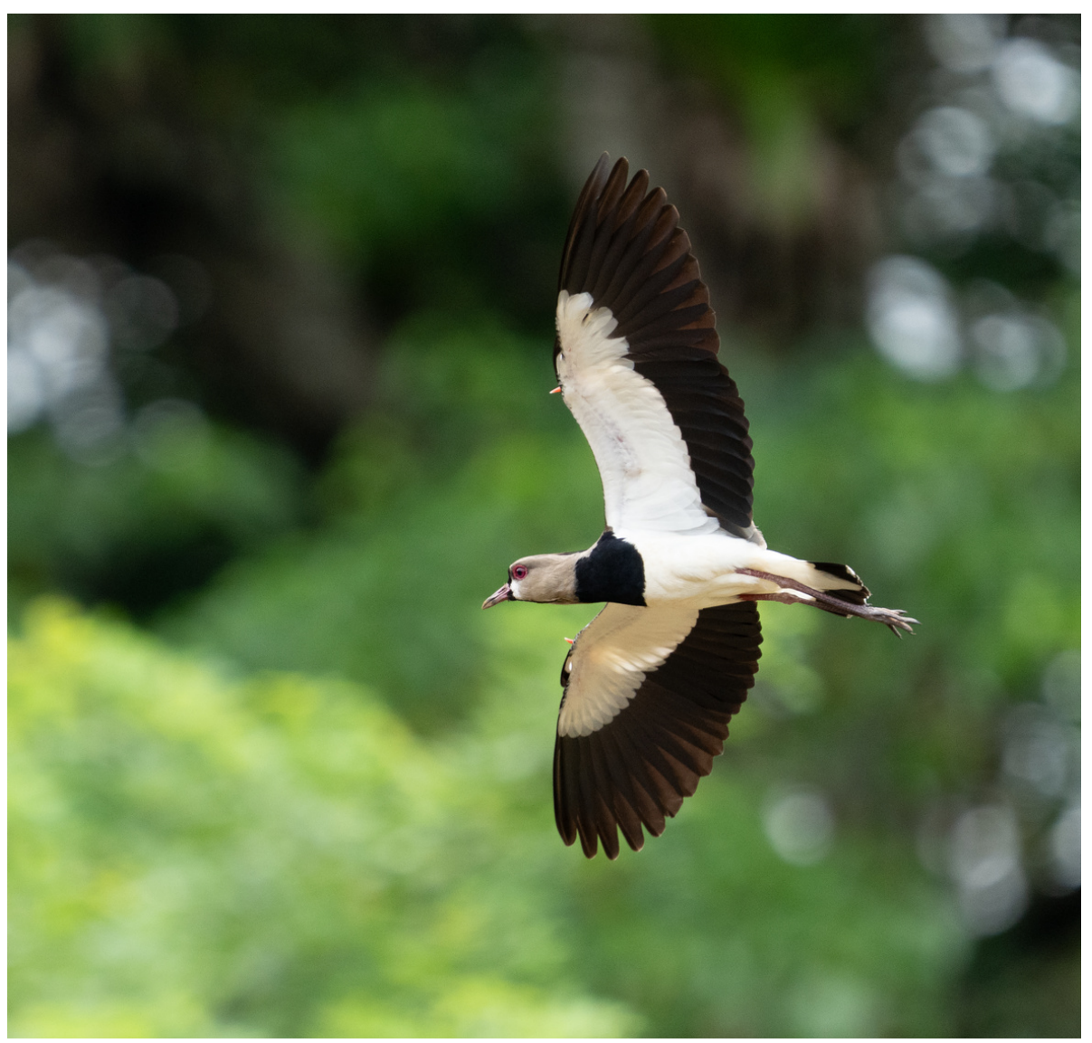
Southern Lapwing (in Panama)

CHATTANOOGA CHAPTER OF THE TENNESSEE ORNITHOLOGICAL SOCIETY