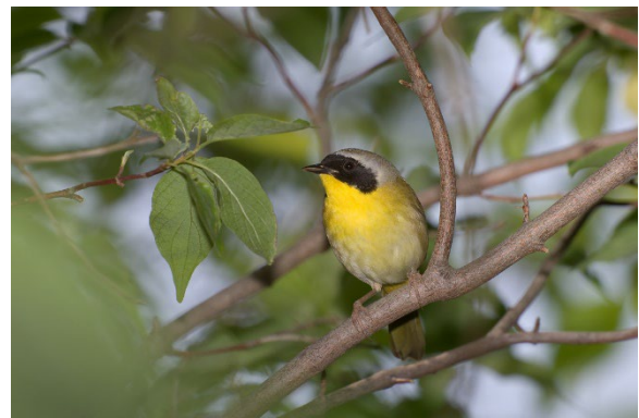
Common Yellowthroat at Magee Marsh

Monthly meeting room setup and cleanup: Help place chairs and tables or put the room back into shape at closing.