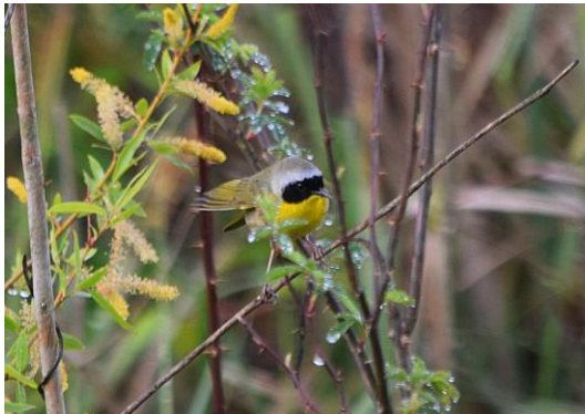
Common Yellowthroat