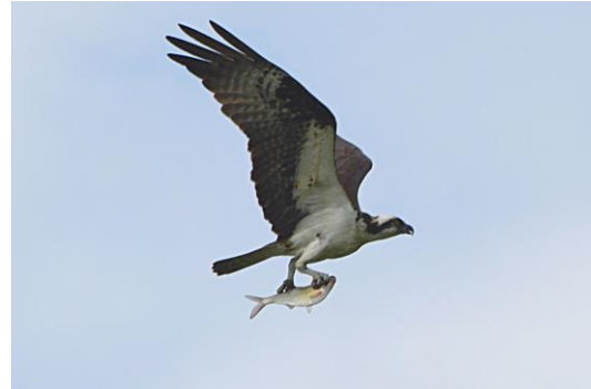
Osprey with Lunch